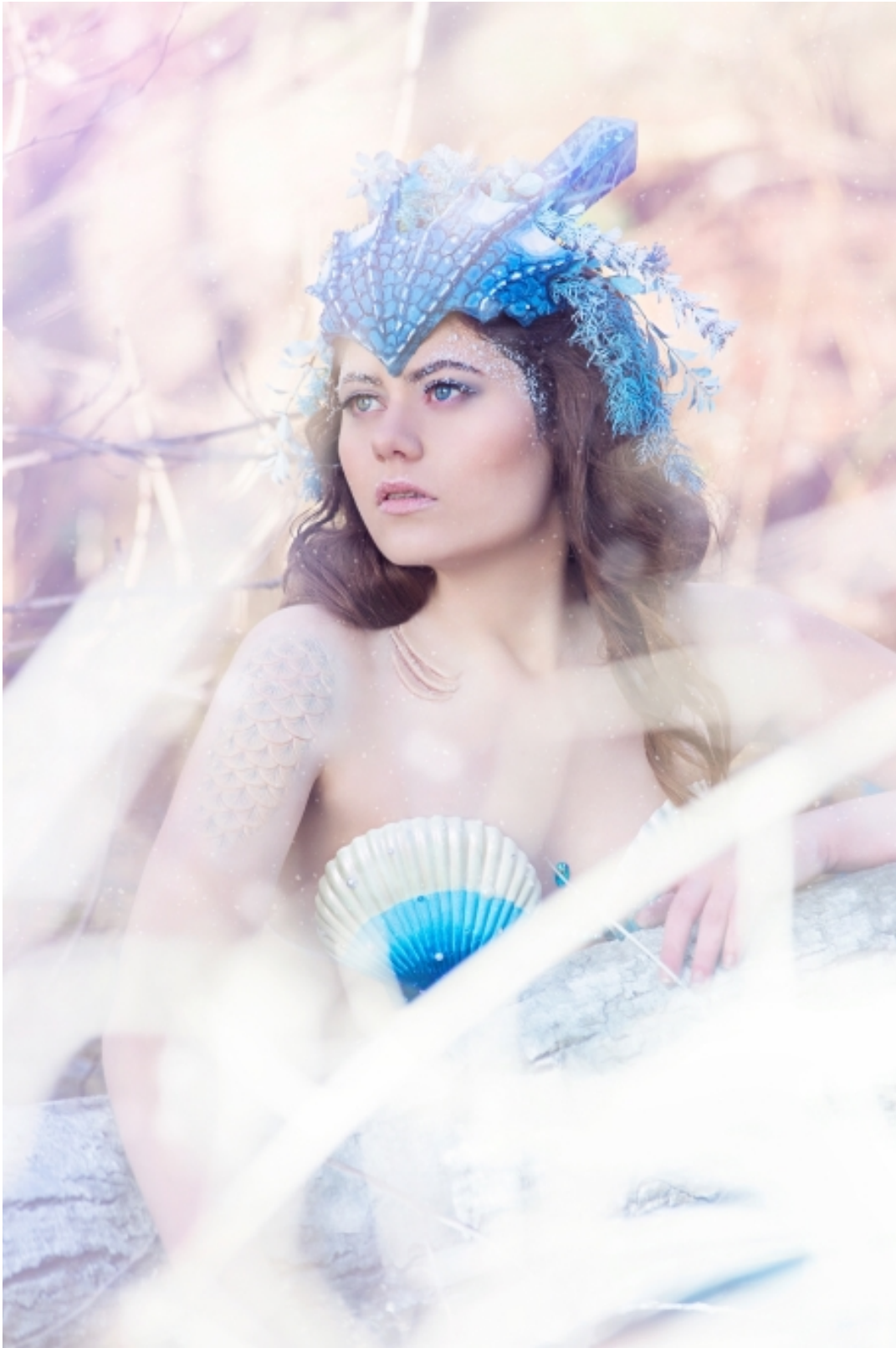
Model: Hella Maenad MUAH: Lorraine Kühnen - SFX: Isil Creations Shell Bra: Shelltastic Gklieter - Headpiece: Leijona Creations BTS-Film & Assistent: Loes Gorseling Photography