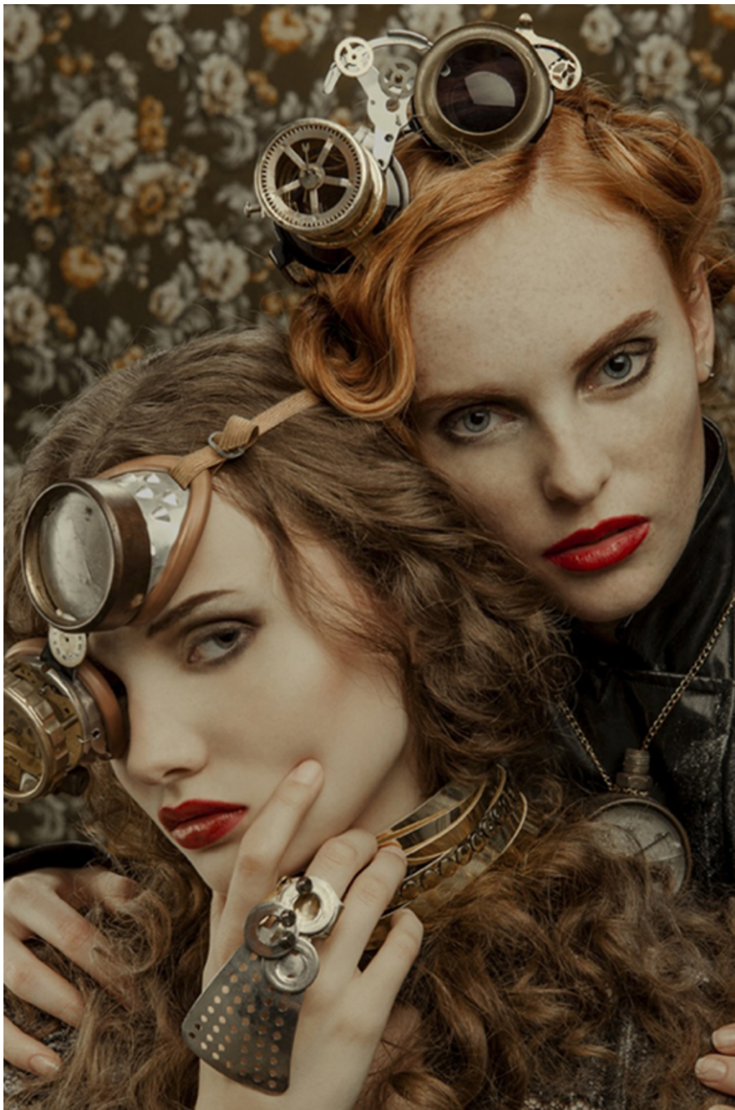
MUAH: Serena Palma Make Up