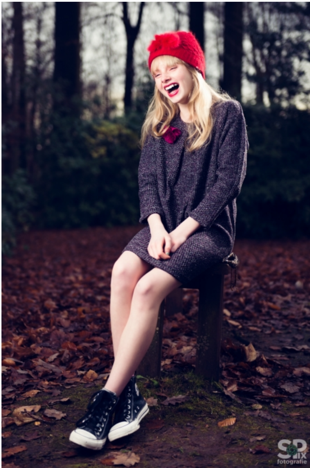
Model : Amber MUA : Winnie Bogaerts Kledij : Pimpernelleke Dendermonde