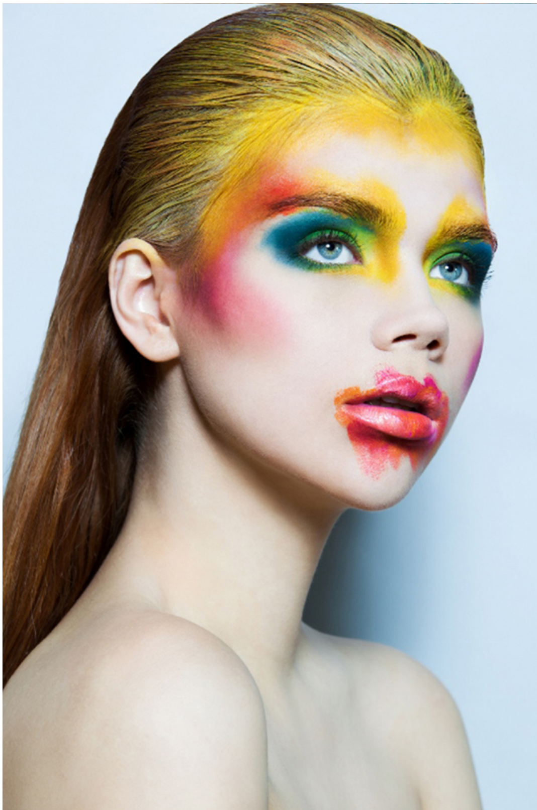
Mua: Serena Palma Make Up